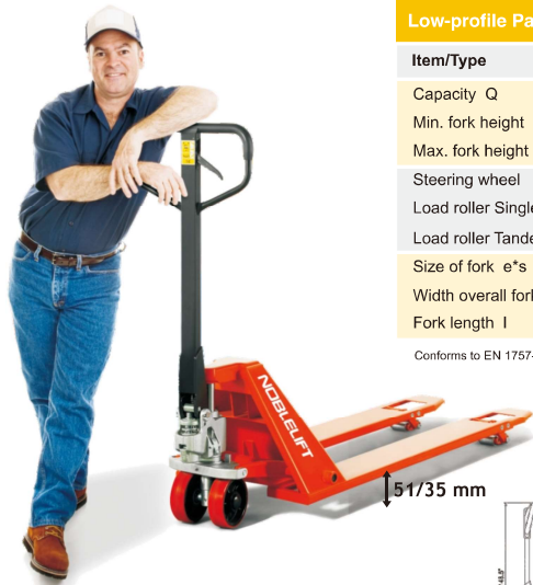
Low-profile Pallet Truck(51MM/35MM) 1KG=2.2LB 1INCH=25.4MM