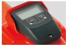
Only 2 keys needed for operation New: Totalization function!

Capacity: 2000 kg in 5 kg steps Scale functions: zero correction, total weight Electronic lifting height indication in display Power supply: 2 standard 1.5V AA / LR6 batteries Possible to reach 3,000 weightings on a set of batteries Original fork dimensions Splash proof: IP65