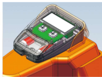
Indicator powered by two AA batteries (2x1.2-1.5V), which are located behind a sealed cover