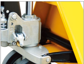
Adjustable pump cap