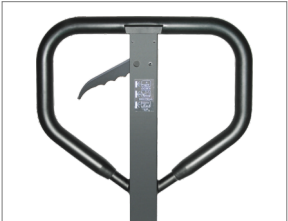
Option: fully rubber wrapped handle